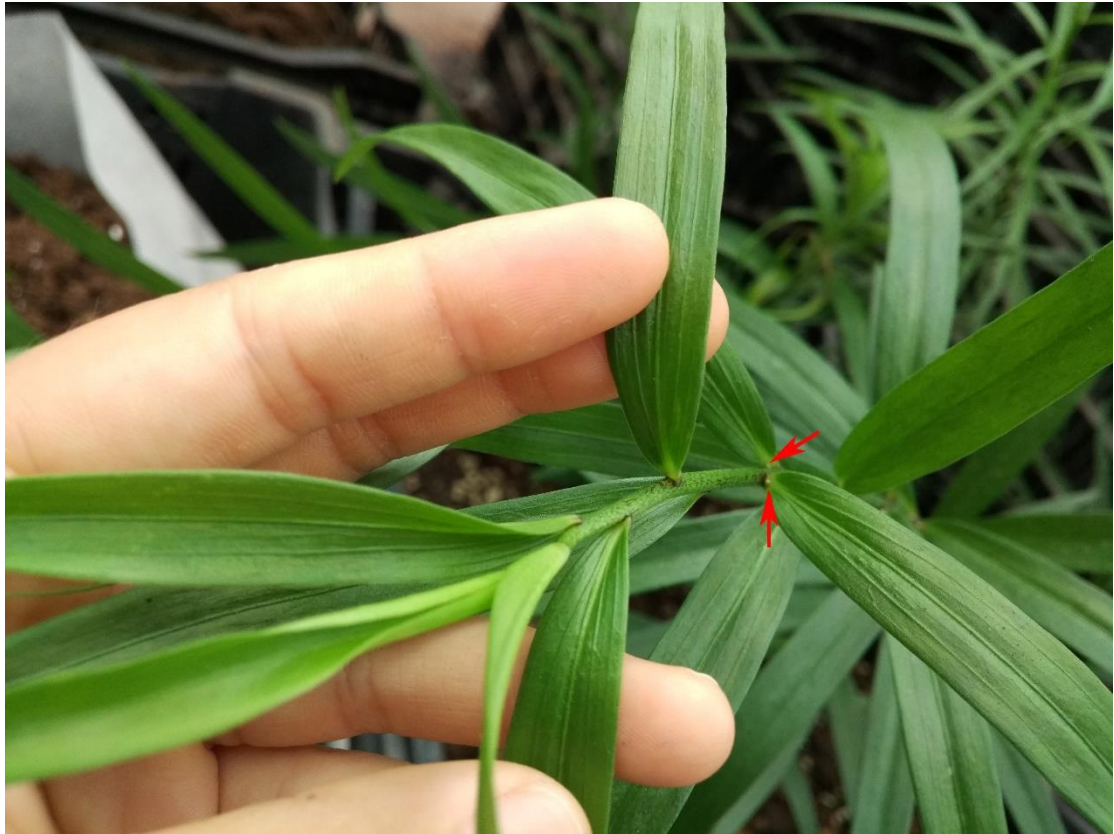
Fig. S2. Lilium sargentiae . Red arrow showed the white bulbil structure.